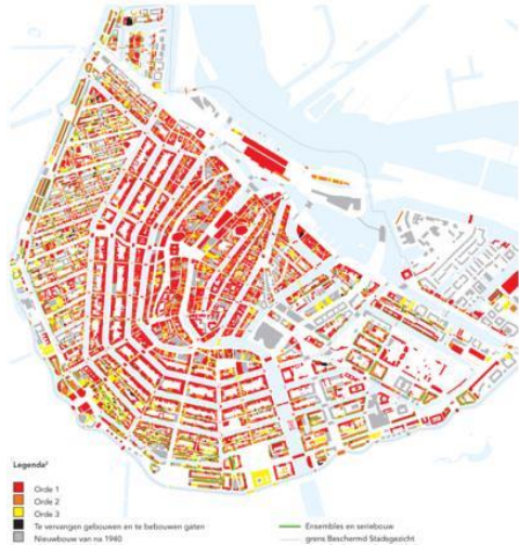
Fig. 1.(left) The core zone of the World Heritage site entitled "Seventeenth century canal district within the Singelgracht, Amsterdam"